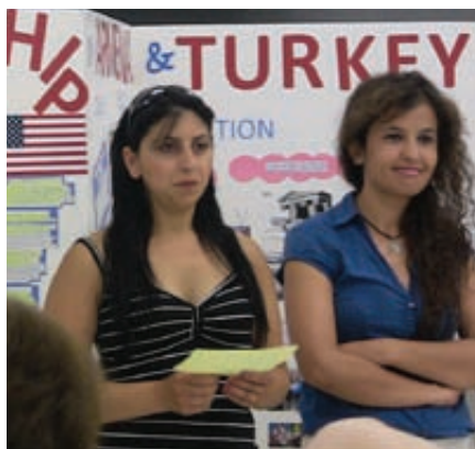
Turkish and Armenian teachers present a project before the group.

The focus was largely on how to help the teachers bring more student-centered learning to their classrooms. All were middle and high school English teachers in either Armenia or Turkey. Embedded in the professional development institute was a goal of allowing educators from countries with a long history of strained relations to learn about each other.