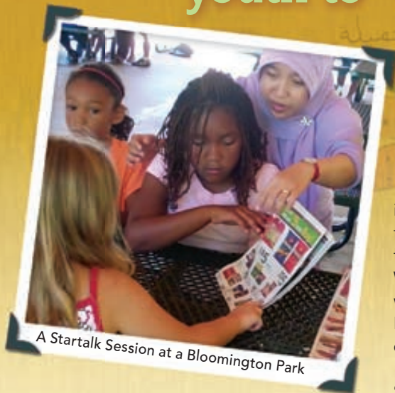
A Startalk Session at a Bloomington Park

Over the summer in Bloomington, students in community summer programs were surprised and excited about the hands-on activities in the non-traditional language learning courses in which they participated. These activities included making a fresh Middle Eastern salad, shopping in an Egyptian market, exchanging money and studying traditional art and culture. The children had fun while becoming more culturally aware and acquiring new language skills.