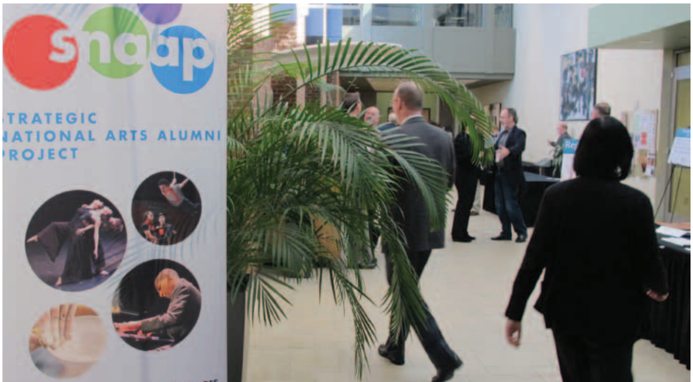
The SNAAP conference at Vanderbilt University in March