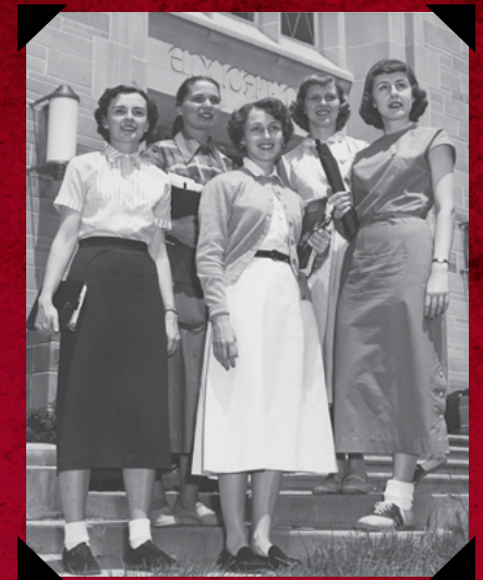
Elementary teachers in 1952

This academic year marks the beginning of Indiana University's Bicentennial celebration. For the past 200 years, IU has changed the world through the work of its students,