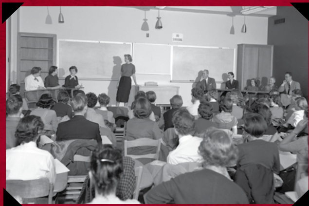
A discussion panel in 1955

faculty and staff. We're celebrating this milestone by taking a look back in our own archives to some photos that show the School of Education in its early days.