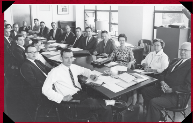
Ph.D. candidates in 1963