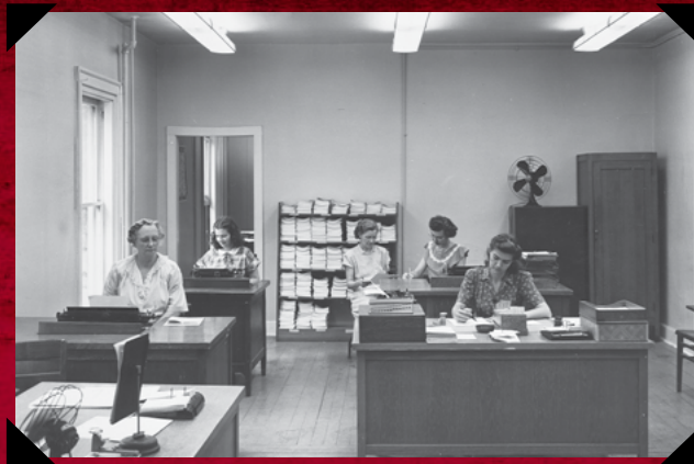
The main office in 1948

INDIANA UNIVERSITY HONORING THE IU BICENTENNIAL